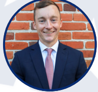
Veteran Sergeant U.S. Army