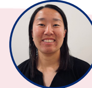
Veteran Captain U.S. Army