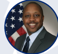
Veteran Master Sergeant U.S. Air Force