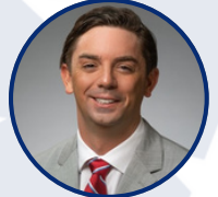
Veteran Lieutenant Commander U.S. Navy