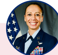
Veteran Master Sergeant U.S. Air Force