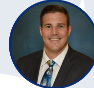
Veteran Captain U.S. Air Force