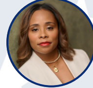
Veteran Major U.S. Army