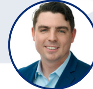
Veteran Captain U.S. Army